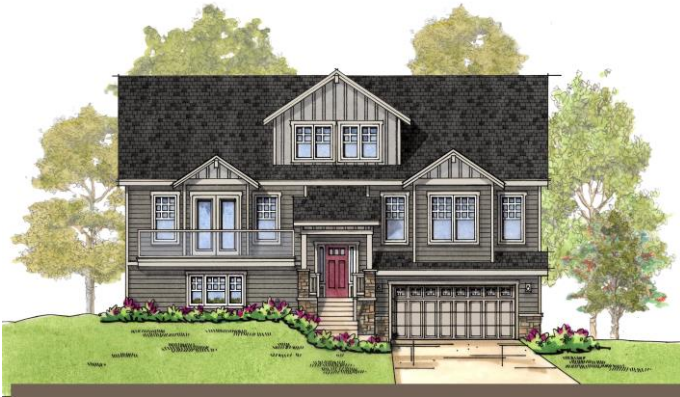
Coastal 1 (included)

3,681 sqft • 4 beds, 4 baths • 2 car garage • great room • study • 2 walk-in closets