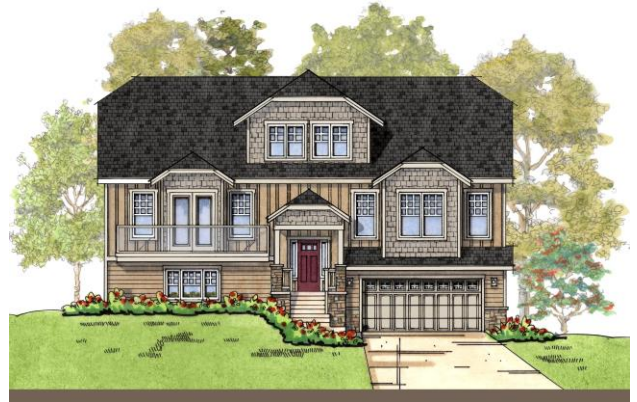
Coastal 2 (optional)